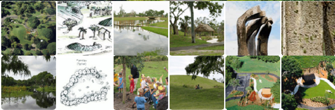
WEST PALM BEACH, FLORIDA 2003-2004

The City of West Palm Beach redesigned Dreher Park, the premier park within the City's park system. The Park is a multi-use public park, surrounded on three sides by diverse neighborhoods. A major component of the Park's redesign was to revamp the Park's water flow and flood control systems. Eight acres of inter-connecting lakes and retention ponds have been built to catch, hold, and drain storm water within this 113-acre urban regional park.